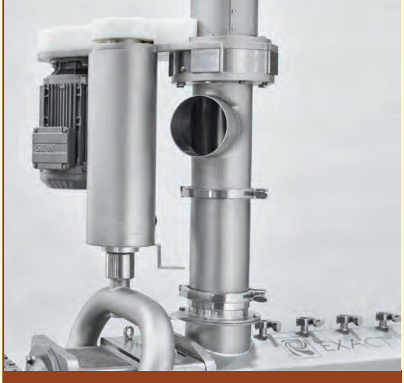
Ingredients are fed directly into the Hydrobond unit and mixed together before entering the mixing chamber.

The Exact Mixing Hydrobond Technology brings liquids and a dry ingredient stream together quickly, with little temperature gain. It can be used with a continuous mixer to make the mixing process more efficient or with a pre-hydration system to mix dry ingredients and water directly into a brew holding tank.