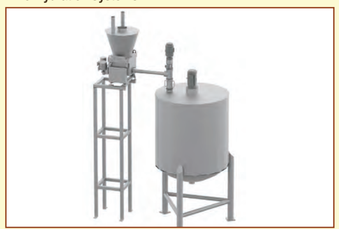
For breads and buns, Hydrobond Technology can be integrated into a pre-hydration system as a first stage mixing process.

Contact us at (610) 693-5816 or info@exactmixing.com for more information!